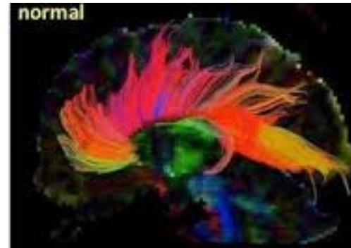
DTI image of brain (no TBI)