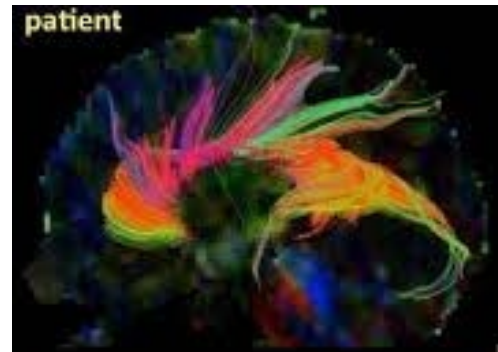
DTI-detected changes to the brain after TBI